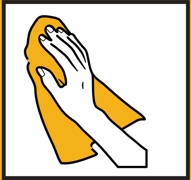
Clean and Prepare